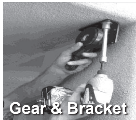
Gear & Bracket